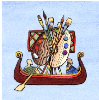
Frontispiece to George Orwell's Keep the Aspidochelone Flying (1936). Deadapted by Richard Curtis for Four Weddings and a Funeral (1993)